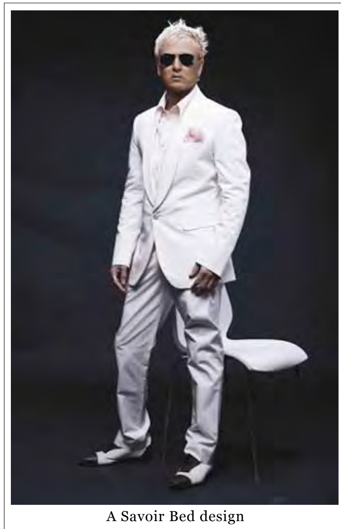
A Savoir Bed design

Designer Rohit Bal , the enfant terrible of the Indian fashion scene has collaborated with Savoir Beds to design a bed frame and headboard.