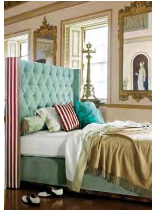
Rohit Bal's Savoir bed

A: The bed will definitely have certain degree of exuberance and a high degree of opulence. It is going to be a piece of art, fancy but at the same time comfortable. I would love to bring out India's luxury sensibilities in the bed which will travel across the world. It will depict the Indian Royal era.