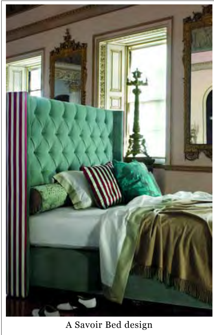
A Savoir Bed design

Savoir Beds has become famous for designing masterpieces for some of our most celebrated and successful people from the world-over like Winston Churchill and Marilyn Monroe to Yasmin and Simon Le Bon today.